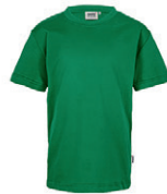
029 kelly green