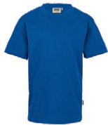
010 royal blue