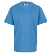
041 malibu blue