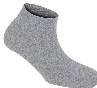
015 mottled grey