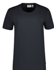
064 carbon grey