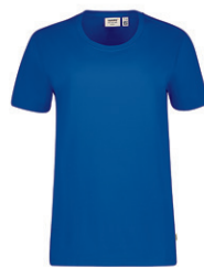
010 royal blue