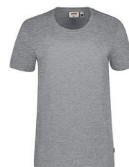
015 mottled grey