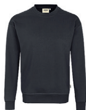
064 carbon grey