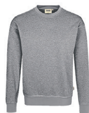
015 mottled grey