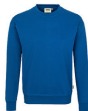
010 royal blue