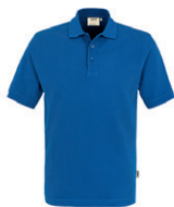
010 royal blue