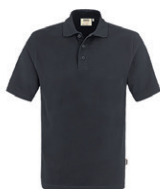
064 carbon grey