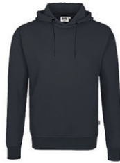
064 carbon grey