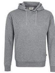
015 mottled grey