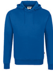
010 royal blue