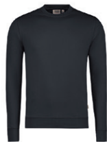
064 carbon grey