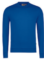
010 royal blue