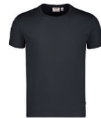
064 carbon grey