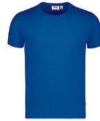
010 royal blue