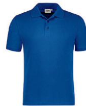
010 royal blue