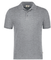
015 mottled grey