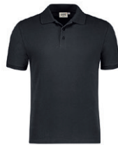
064 carbon grey