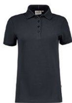
064 carbon grey