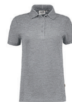
015 mottled grey