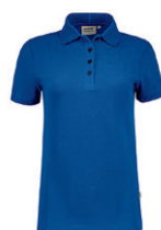
010 royal blue